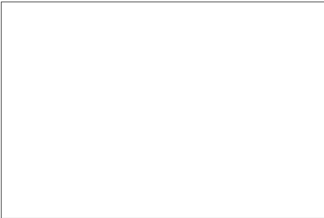
Figure 1 - 5m to 6m high pole retaining wall which exists in high state of bending stress (surcharge on retained upper level is 70 kPa)

The "primary floor beams" and "joists" are cantilevered so that the external walls are 400 beyond the columns. This cantilever is to assist the pole columns remaining dry, to provide a 'sheer' finish to the outside: and for the ease of external cladding.