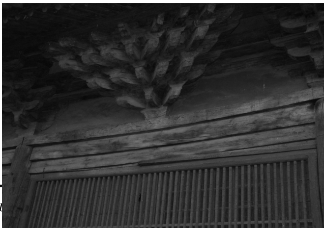
The Shan-sheng Temple was built in the year 1143, enormous diagonal brackets are placed above the column ties. The ties showed signs of dressed smoked timber.